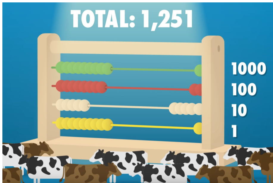
Figure 1: Screenshot_2020-08-09_at_21.34.48.png

Before the invention of actual computers, 'computer' was a job-title denoting people who were employed to conduct complex calculations,