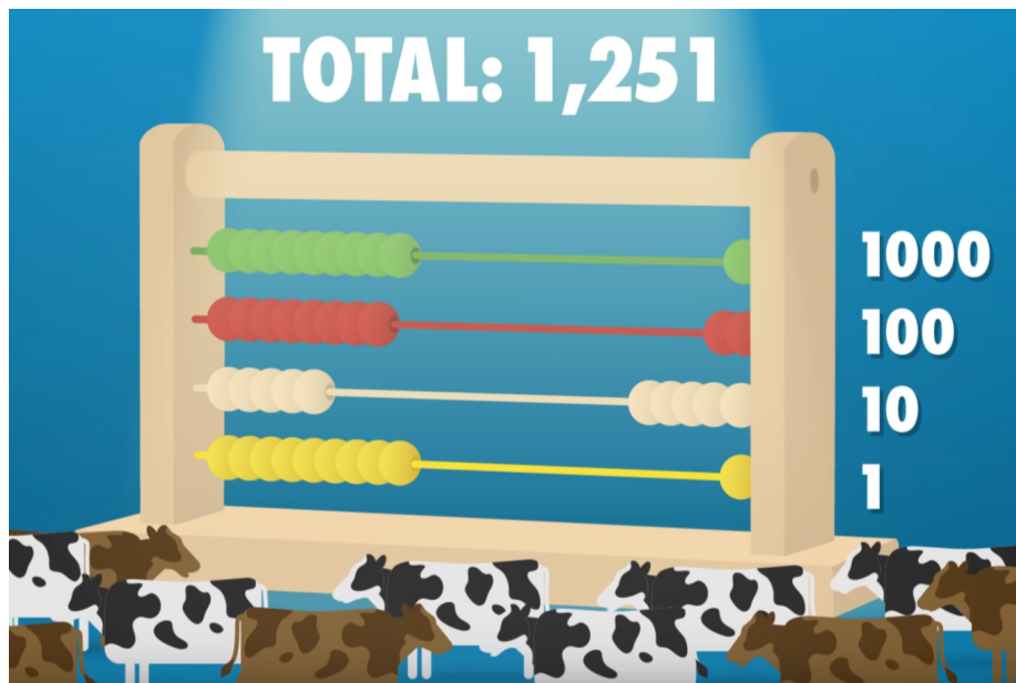
Figure 1: Screenshot_2020-08-09_at_21.34.48.png

Before the invention of actual computers, 'computer' was a job-title denoting people who were employed to conduct complex calculations,